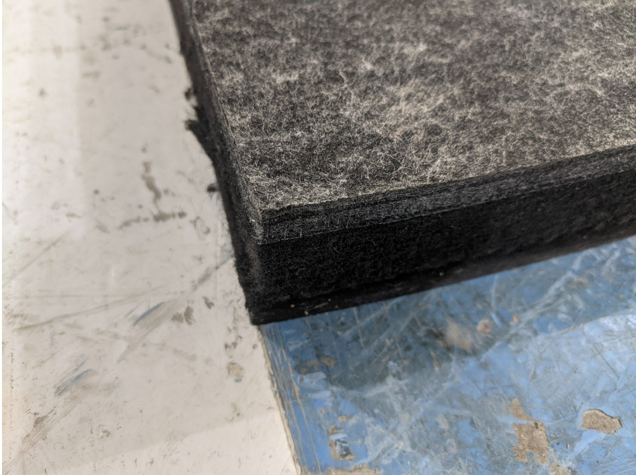
Figure 3 – Detail of specimen materials